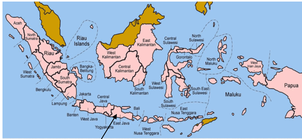
Location study of Malang regency